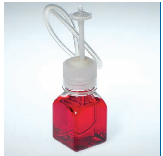
Single 60mL sampling bottle showing Bio-Simplex™ Closure Assembly with an EZ Top® container closure.